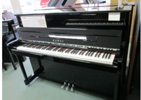
Another mid-sized, new, - about 46"-48" tall.