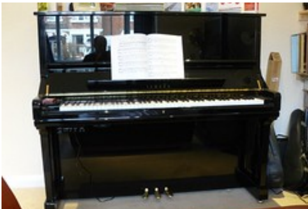
The upright grand style piano - 48"-52" tall.