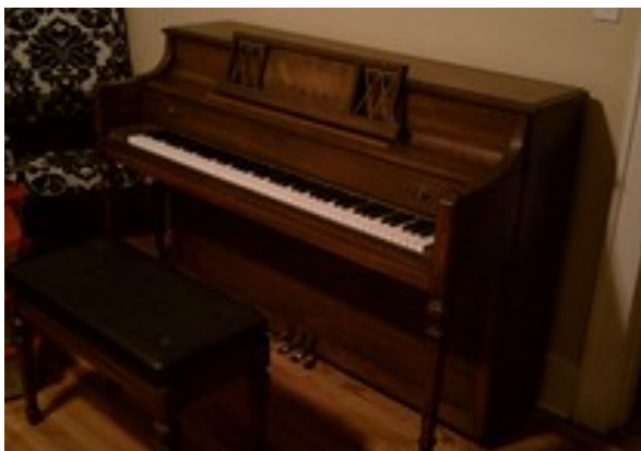
A small apartment-sized piano - about 42" tall. These are often available on craigslist, sometimes for free.