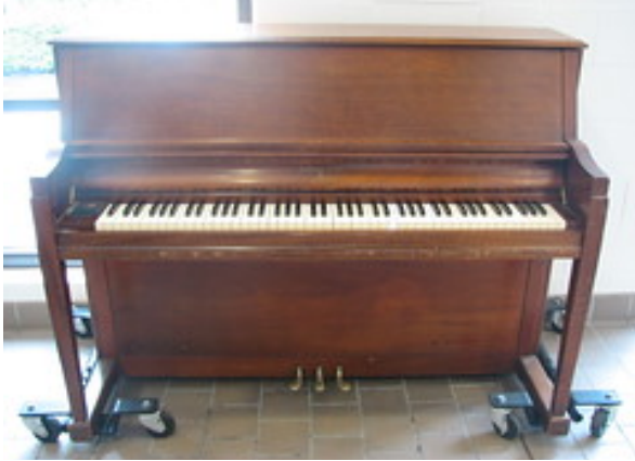
A mid-level sized piano - about 44"-46" tall.