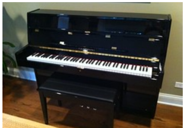
A new, introductory level piano - about 43-44" tall.