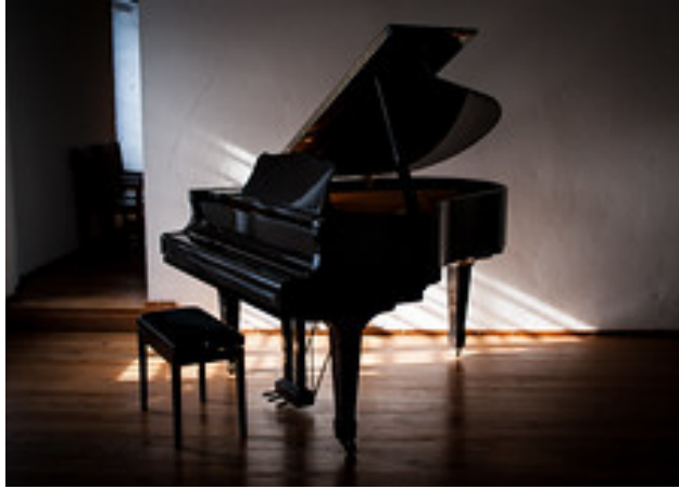
A baby grand piano